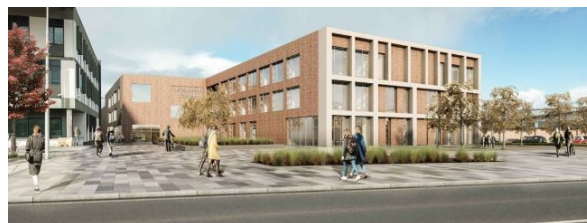
The New Castlebrae as seen from Niddrie Mains Road