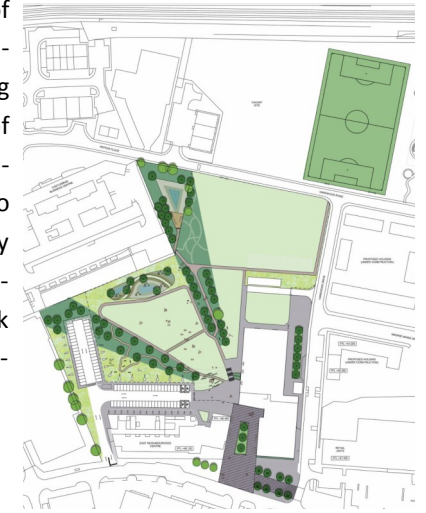
Site Plan for Replacement Castlebrae Building

The aim of these spaces is for them to be integral to the learning environment and not an 'add-on' to more traditional forms of learning. With each curricular Hub having a Learning Plaza, it will provide an opportunity for staff to plan innovative and creative learning experiences together, to further develop and apply skills for learning, life and work in different contexts for the young people. Traditional timetabling methods will adapt and work with the learning spaces, enabling the Learning Hubs to have increased flexibility in terms of empowering curricular areas with the ability to define how the space in their areas is used most effectively.