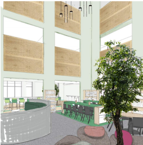
The Literacy Space takes prominence in the Invited Community area at the front of the building

Collaboration in STEM - S1 Microscope Project runs across 2 days, involves partners and parents, bringing together skills development in Maths, Science and CDT