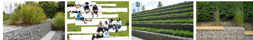
ED12484 | Replacement Castlebrae High School